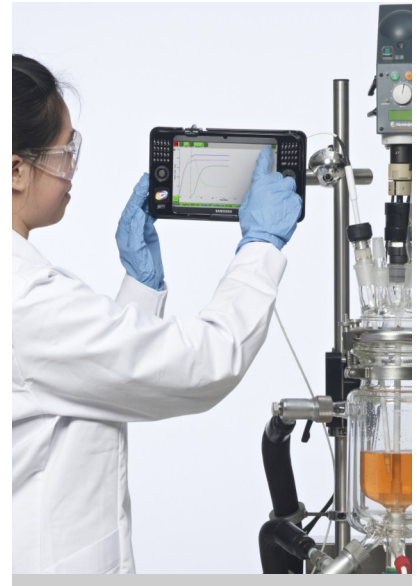
Real time data displayed graphically, via touch control interface

Innovative and expandable system, backed up by 25 years experience in reactor design