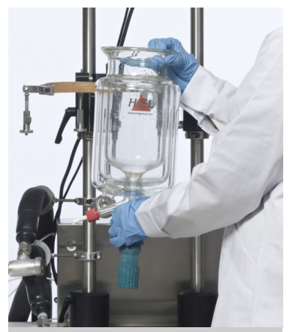
Vessel pulls out by undoing just one support clamp